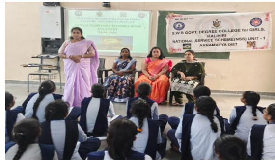
vivo V50 | 35mm 1/2.8 1/50s ISO961 01/30/2026, 16:51