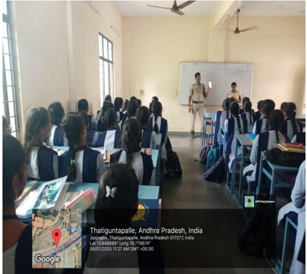
Thatiguntapalle, Andhra Pradesh, India Jaxi+g6h, Thatiguntapalle, Andhra Pradesh 517277, India Lat: 13.648838° Long: 78.730222° 04/07/2025 11:27 AM GMT +05:30