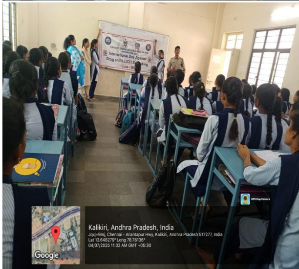
Kalikiri, Andhra Pradesh, India Jaxi+9m3, Chennel - Anantapur Hwy, Kalikiri, Andhra Pradesh 517277, India Lat: 13.648279° Long: 78.78136° 04/07/2025 11:32 AM GMT +05:30