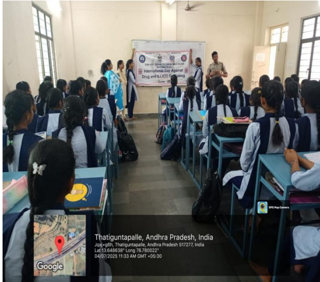
Thatiguntapalle, Andhra Pradesh, India Jaxi+g6h, Thatiguntapalle, Andhra Pradesh 517277, India Lat: 13.648838° Long: 78.730222° 04/07/2025 11:33 AM GMT +05:30